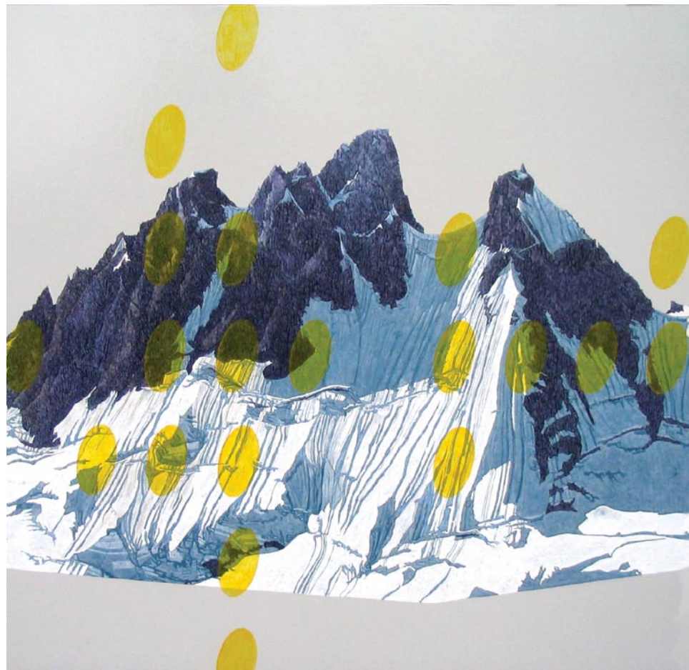
"The Four Gaurdsmen, Central Coast", Oil on Panel, 42" x 48", 2008

Vancouver, B.C., 1558 West 6th Avenue V6J 1R2 ph. (604) 736 - 8900 736 - 8931 fax vancouver@douglasudellgallery.com • www.douglasudellgallery.com