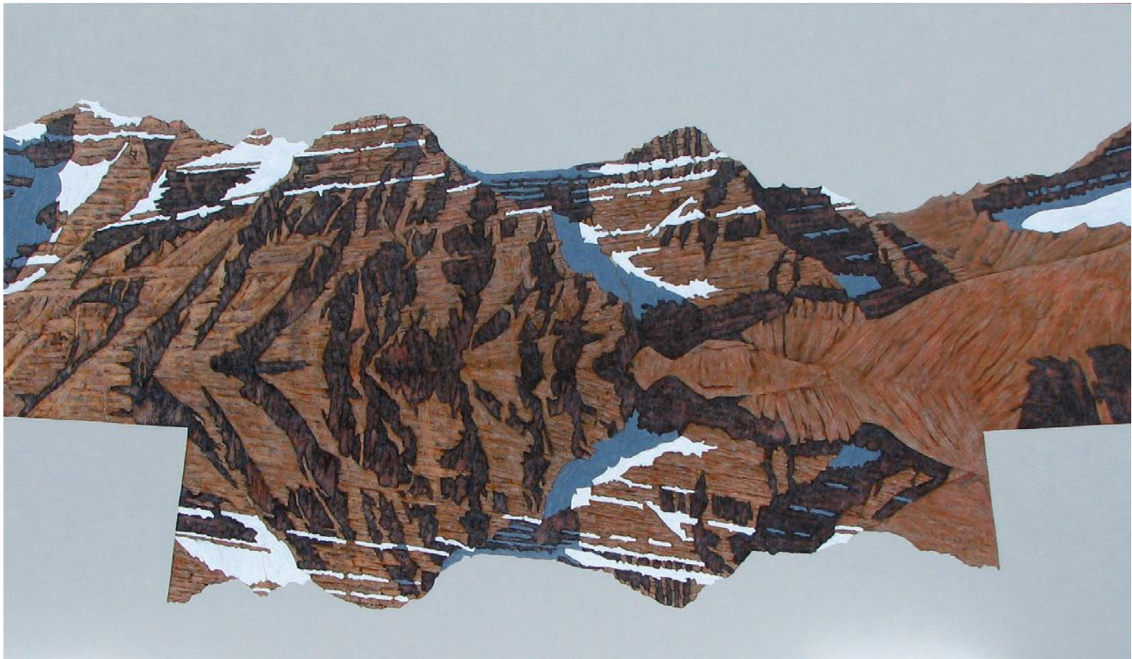
"Niblock Mountain Unfolded", Oil on Panel, 24" x 48", 2008