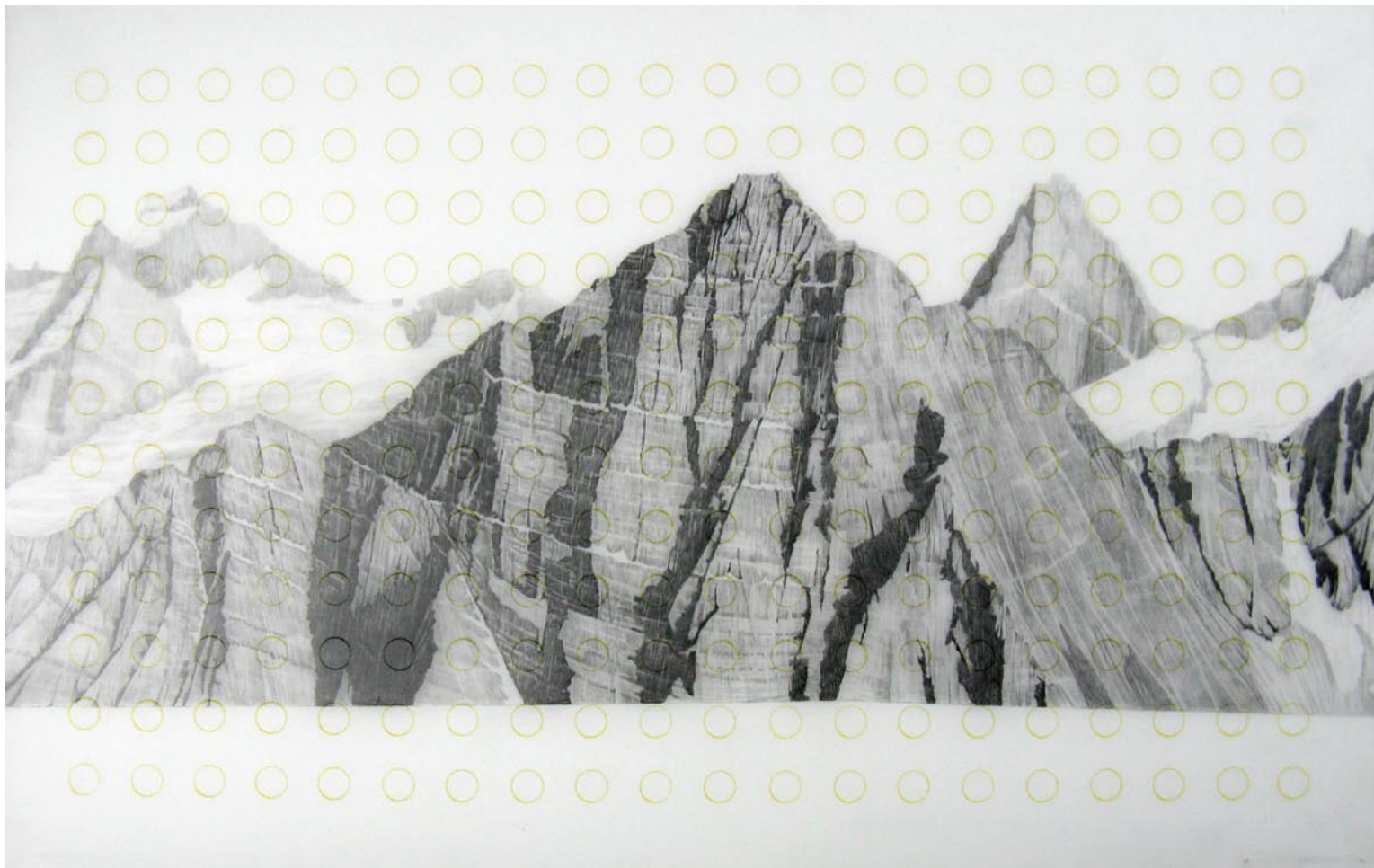
"Mt Sir Macdonald, the Selkirks", Graphite and Pencil Crayon on Mylar, 14" x 22", 2008