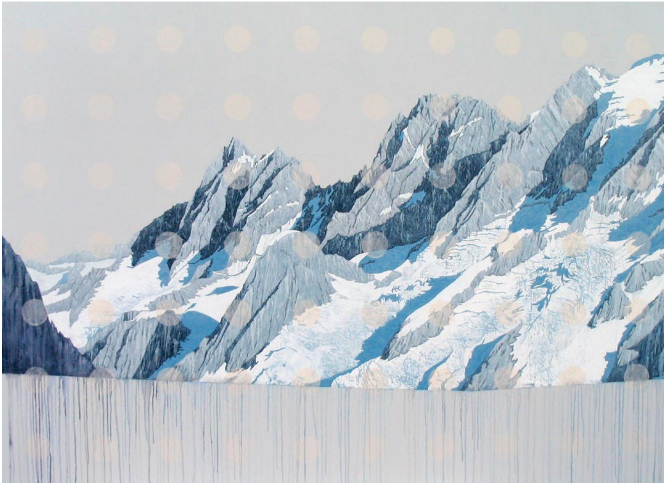
"The Tiedmann Valley, Waddington Range", Oil on Canvas, 64" x 88", 2008