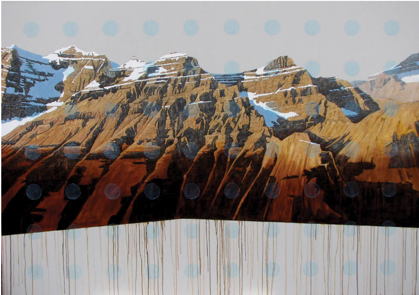
"Niblock Mountain, the Rockies" , Oil on Canvas, 64" x 88", 2008